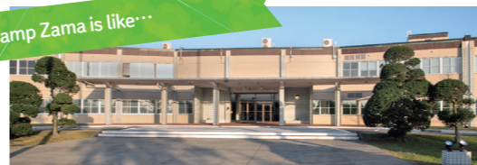
Building of Headquarters US Army Japan-So called "Little Pentagon"