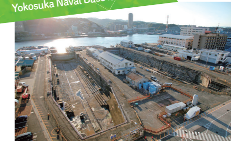
There remains precious heritage of modernization such as the dry dock built in Meiji through Showa era.