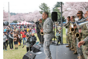
During the Sakura Festival held every spring, Military Band plays and enhances the festival.