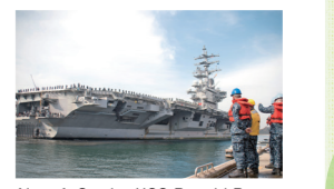
Aircraft Carrier USS Ronald Regan sailing into Yokosuka Naval Base leading crew of over 5,000 members.

You can obtain more information about USFJ installations from LMO website. https://www.lmo.go.jp/recruitment/index3.html