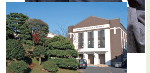
Commander Fleet Activities, Yokosuka It uses the building of Yokosuka Chinju-fu period.

US-Japan Spring Festival (late March or late April) Yokosuka Friendship Day (early August) Yokosuka Mikoshi Parade (October) US-Japan Historical Tour (twice in spring and twice in autumn)