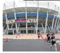
Many runners regardless age or gender, participated in various costumes and got a positive feedback at Iwakuni Friendship Relay Marathon.