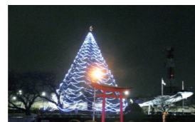
The big tree on the Friendship square is decorated with a lot of illumination. Many children gather at the switching ceremony and enjoy it very much.