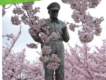
Entering the main gate, stands the statue of General MacArthur. Many cherry blossoms are planted around there and are in lovely bloom in spring.