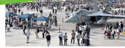
"Friendship Day" which has been taking place since 1973 is one of the biggest events of Iwakuni in which over 200,000 visitors participate. Many visitors enjoy exhibition of aircrafts and aerobatics, genuine American hamburgers and pizzas.