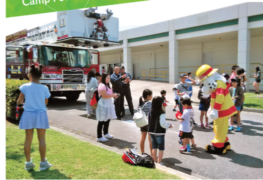
Once a year, Appreciation Day for USFJ employees is held at Camp Foster. It is popular among USFJ employees because they can introduce their working environment and co-workers to family and friends who do not usually have a chance to come inside the facilities.