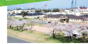
"Risner Circle" with cherry blossom and the building of the Commander