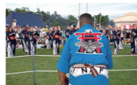
At the Bon-odori festival held in every summer, the commander beats the drum and the members of the US Military Personnel Women's Association play as Bon-odori dancers to arise the festival.

NAF Atsugi and JMSDF Atsugi Air Base Spring Festival (the end of April) US-Japan Bon Odori Festival (mid-August)